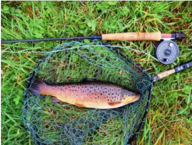
Triploid trout caught on the Itchen