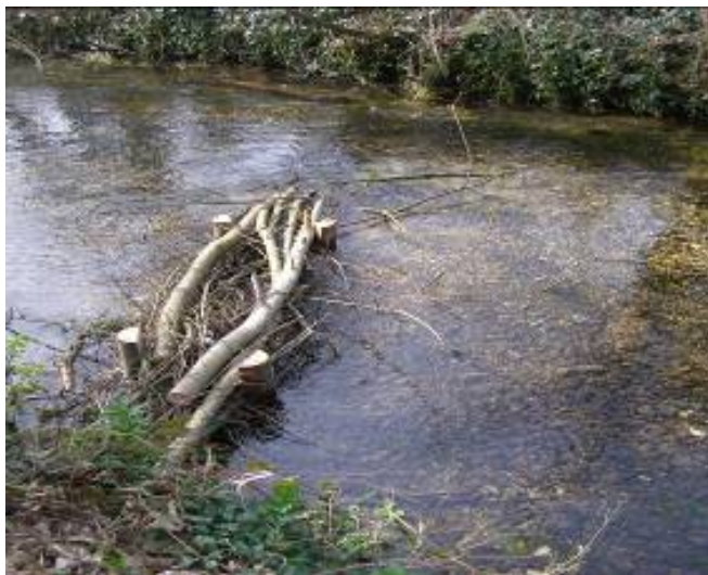
Woody debris structure

We have completed the first phase of a package of works to address poor habitat on the River Loddon at Old Basing, to the east of Basingstoke.. This includes the installation of small woody debris structures along the channel bed. By increasing flows and deflecting sediments, these structures will improve the reach by creating areas of clean gravels suitable for trout spawning .