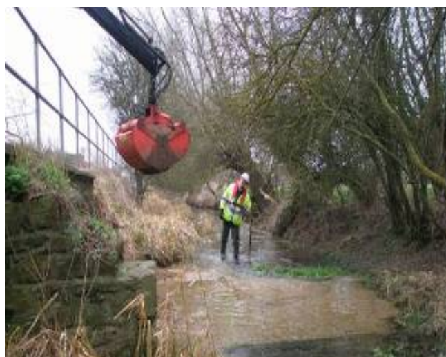
Gravel introduced to Churn

We have created a new brown trout spawning riffle on the River Churn, North Cerney, Gloucestershire. At South Cerney, on the same river, we used 7.5 tons of gravel to drown an existing weir which was a barrier to fish migration, and create a spawning riffle for brown trout.