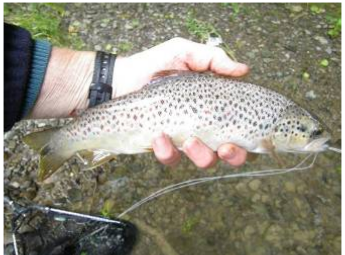
Perfect.....a wild brown trout.

Please forward this newsletter to anyone you think may be interested. They can subscribe to receive future issues by emailing trout@environment-agency.gov.uk .