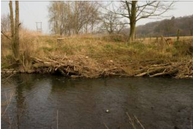
New bank habitat for wild brownies.

The fish appear to be rewarding the anglers for their efforts. Brown trout catches are improving, and in 2006 grayling appeared in club waters, and are breeding, for the first time in living memory. Last year the new arrivals accounted for 40% of the catch. Encouraged by the fruits of their labour, the committee voted in 2012 to cease stocking for a three-year trial period.