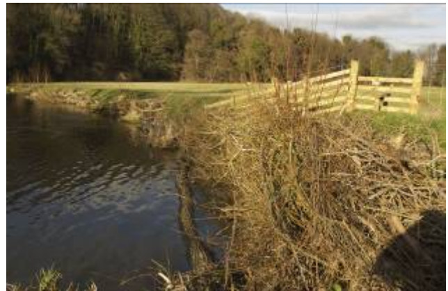
An example of bank improvement works

long-term work plans for the overall environmental improvement of the fishery. The Club ceased heavy stocking of 'takeable' trout and instituted a limited regime of yearlings; no more than 250 fish per season over the 2.5 miles of the fishery.